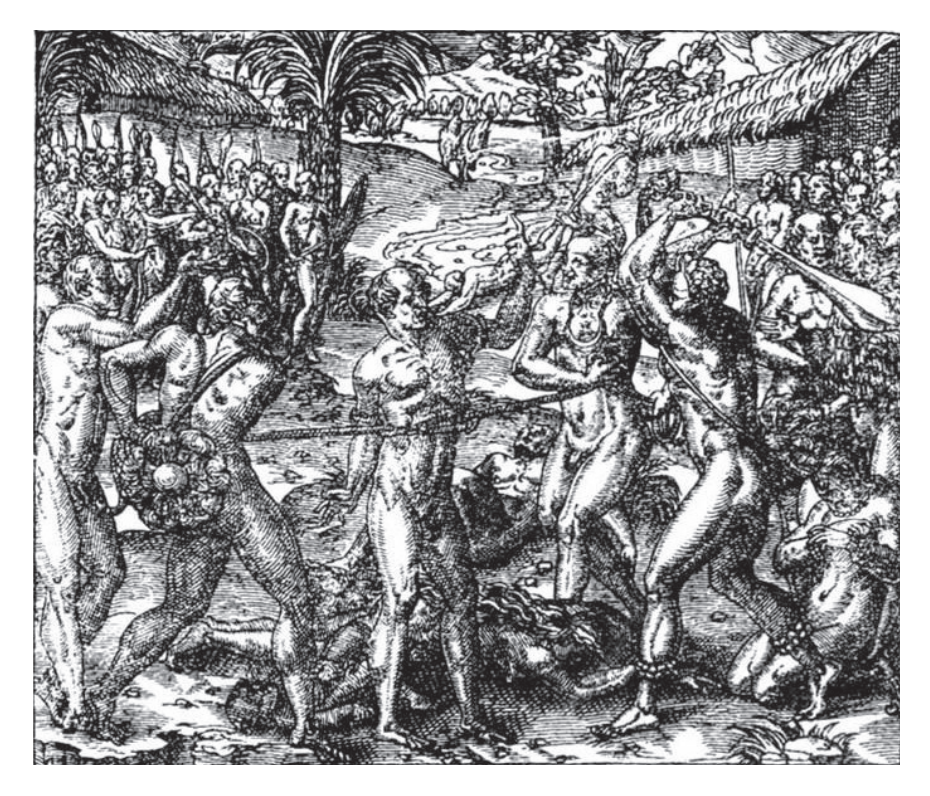
Figure 1. Thevet's portrayal of a captured enemy being prepared for execution.

As he described the lives of the Tupinamba Indians, Thevet balanced what he admired against what he abhorred, and what he found curious against what he considered reprehensible. In battle he found them fort et ferme and was impressed by their use of music to celebrate their victories.<sup>21</sup> However he was appalled by, and described in pictures, their practice of capturing enemies with a view to clubbing them to death and grilling and eating their flesh.<sup>22</sup> On the other hand he was touched by the hospitality shown by the Tupinamba towards people other than their foes, and he was fascinated by their practice of having young women weep to show that visitors were welcome to their homes.<sup>23</sup> However he decried their practice of offering young women to strangers for their sexual gratification, and he considered the resultant venereal disease that had spread even to Europe as a just recompense for debauchery; therefore he commended Villegagnon