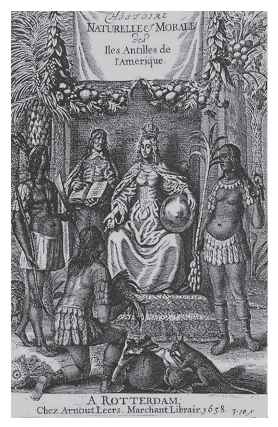
Figure 7. Frontispiece to de Rochefort's text