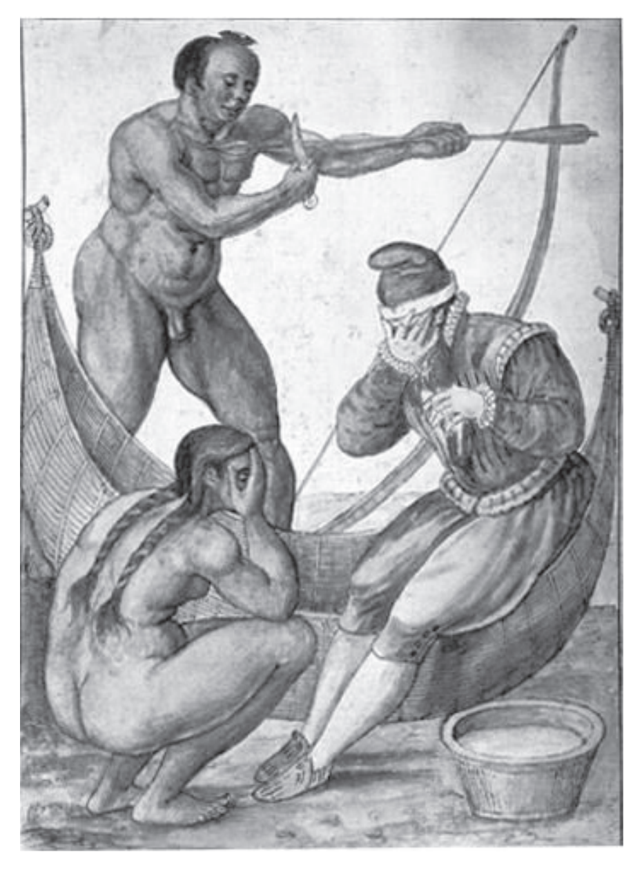
Figure 4. De Léry's depiction of a young Tupinamba woman weeping to show welcome to a stranger.