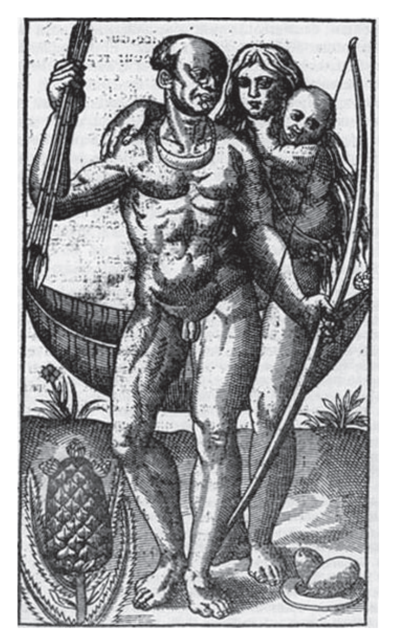
Figure 3. De Léry's depiction of an idealised Tupinamba man, woman and child.