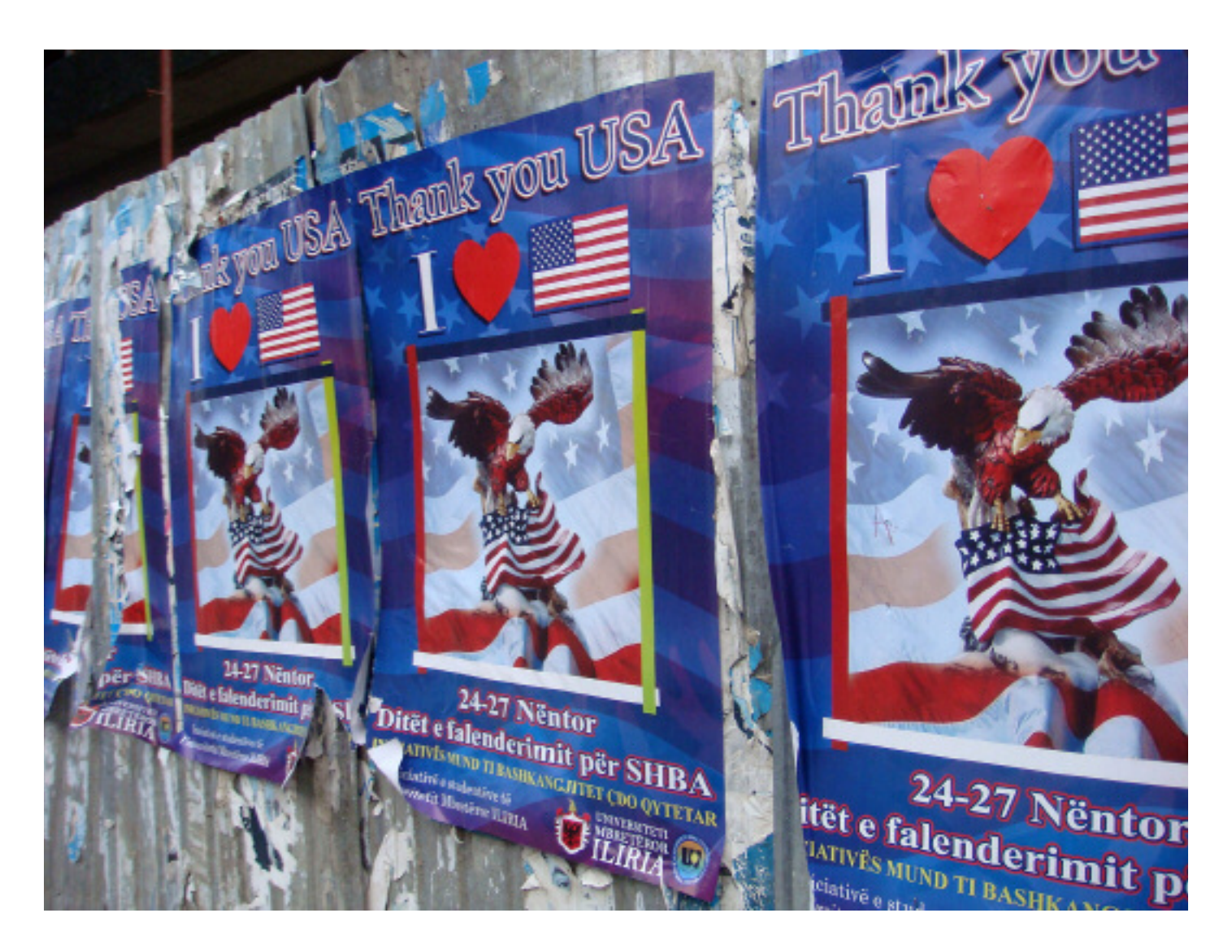
Figure 4. A different perspective on foreign intervention: posters from Peje (Pec), reflecting Kosovo Albanian gratitude towards the United States.

appropriate register for dealing with disputes between different patrilineages or larger groups conceptualised as male brotherhoods – including those between Serbs and Albanians.