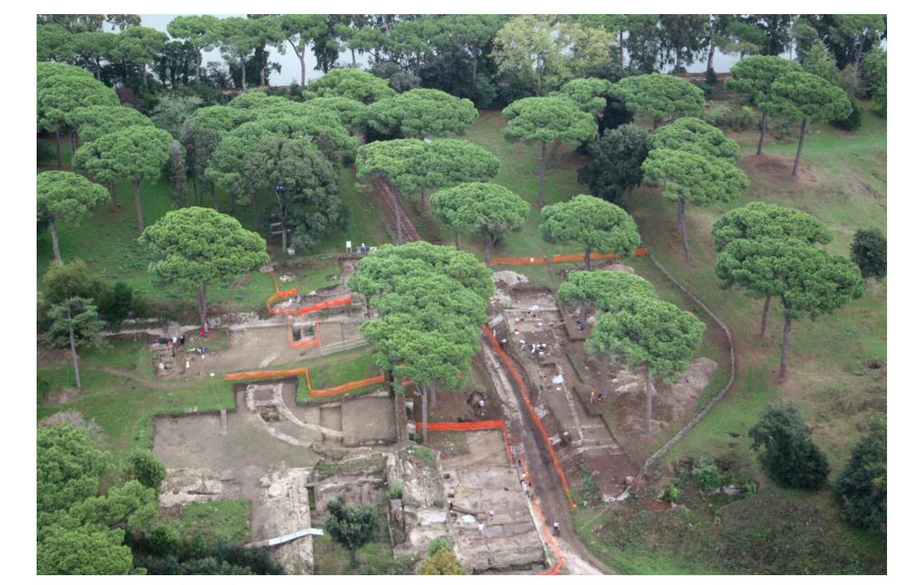
Figure 1. Aerial photograph of the 2009 excavations of Portus.

Inevitably the great size of the port presents the archaeologist with the challenge of developing a methodology that will enable meaningful answers to research questions to be provided within a reasonable period of time – in this case five years. The main focus of the Portus Project has been directed towards the Palazzo Imperiale , or 'Imperial Palace'. This is a three-storey complex covering 3 hectares, which lies at the centre of Portus and holds the key to understanding the development of the port between the mid-1st and mid-6th centuries AD (Figure 1).