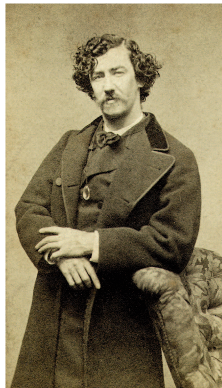
J.M. Whistler.

artist son in Chelsea, was only accepted by the Academy in 1872 after the portrait painter Sir William Boxall had threatened to resign. By