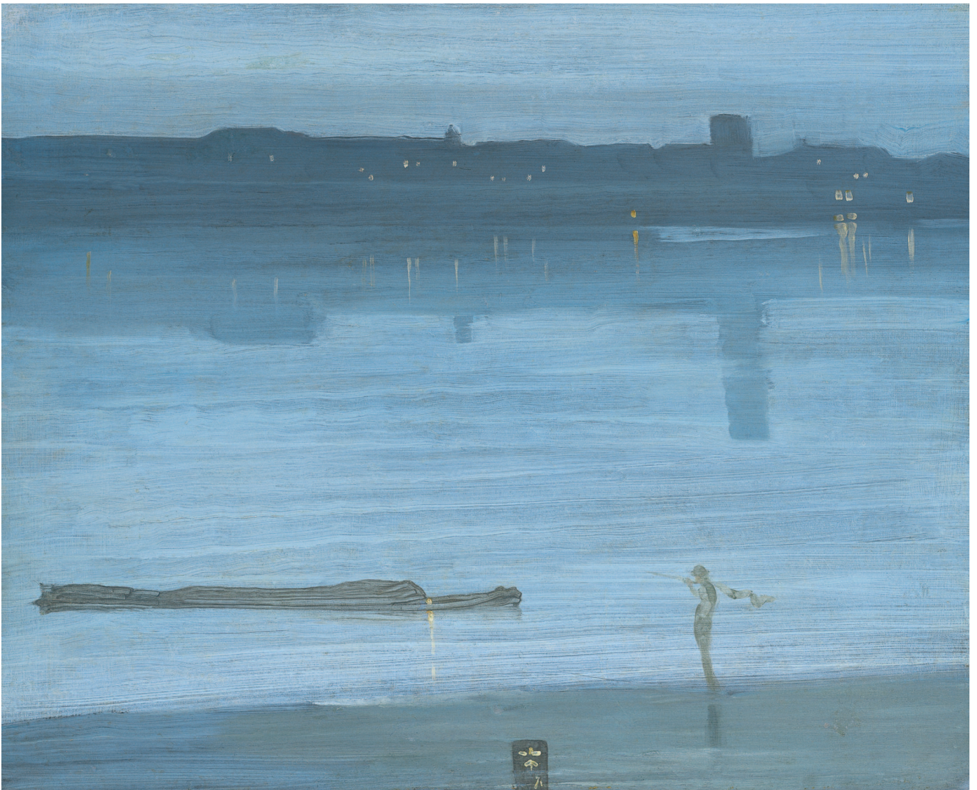
Nocturne: Blue and Silver – Chelsea by J.M. Whistler.

Although the editors came to the project with IT skills limited to a knowledge of word processing and not much else, we settled fairly easily into the procedures required by