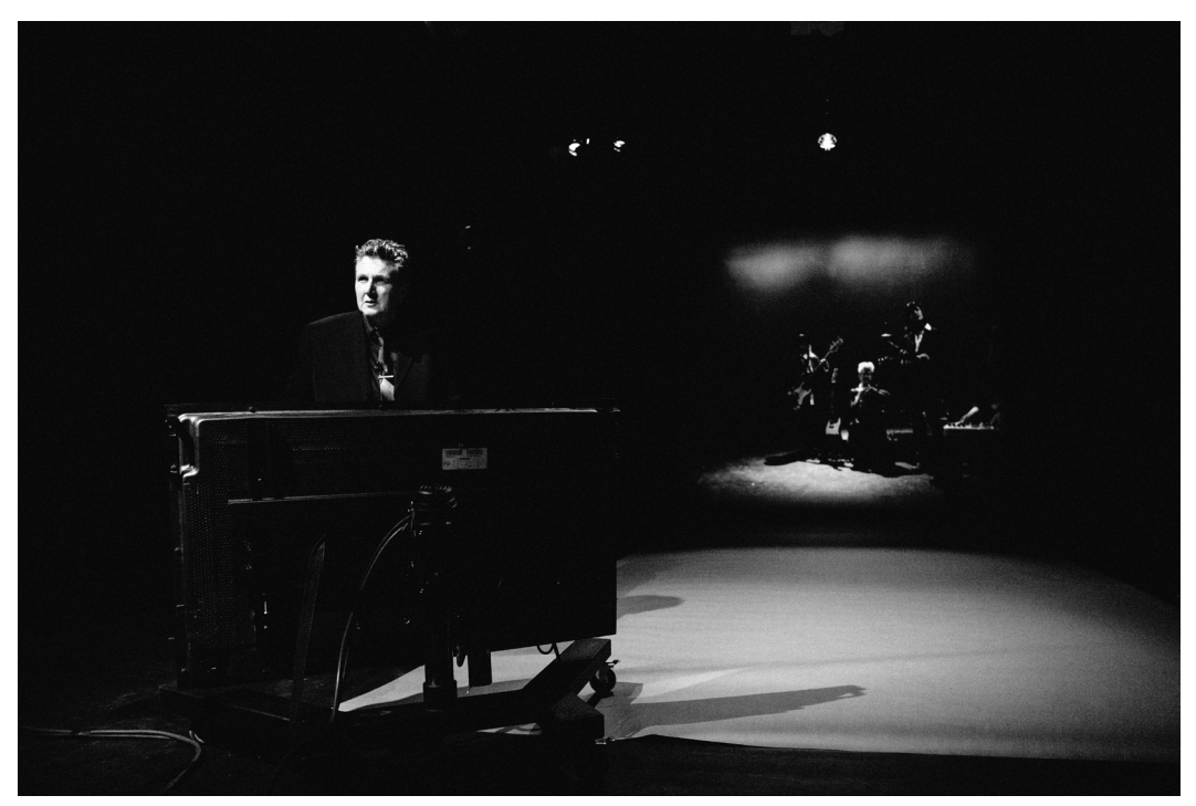
Figure 2. Peggy Shaw in Ruff (2012) with a video projection of her band upstage and a monitor feeding her lines downstage.

Shaw's show is peopled by the myriad of others whom she invokes: artists, musicians, her sister and – importantly – many younger versions of herself – roasting a turkey as a young adult; camping at 17; and, at 13, captured in her family's one and only home movie in a green dress for her sister's wedding. As these back-and-forth references to herself across her lifetime show, Ruff stages non-normative life narratives, as well as portraying a life that is non-chronological/chrononormative. Similarly, Shaw presents her 'family' as both biological – including her sister – and queer, non-biological and chosen, including other queer New Yorkers. The show stages Shaw 'recovering' from a stroke but in non-normative ways for an older person. She makes a punkish public service announcement that formally rejects ageist expectations about aesthetics and propriety and, as Moore suggests, portrays Shaw not only as vulnerable herself – as someone recovering from a stroke – but also as actively caring for her audience by teaching and entertaining them. <sup>36</sup> Ruff also shows Shaw as expertly in control of new technologies like green screening which, as Moore observes, frames 'Peggy's newfound disabilities as possibilities for innovation'. <sup>37</sup>