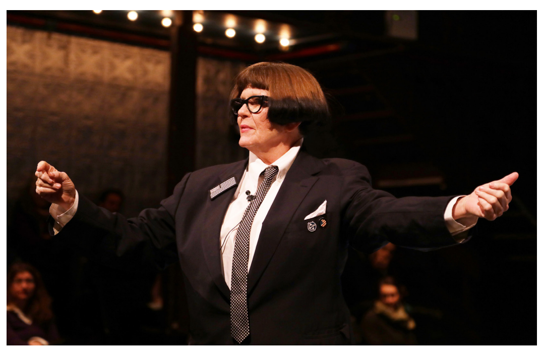
Figure 4. Lois Weaver orchestrating the action as the President in Unexploded Ordnances (2018).