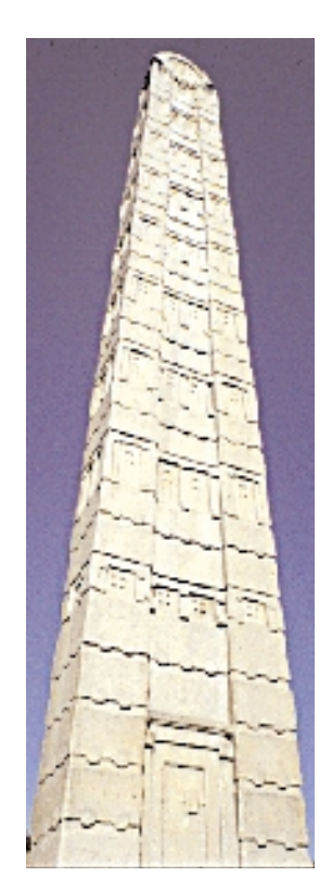
The still-erect Stela 3, now dated to the late third century or beginning of the fourth

The first-century text known as the Periplus of the Erythraean Sea records that ivory was a major Aksumite export; and a fourth-century tomb has yielded quantities of finely turned and carved ivory in the form of boxes, decorative panels and furniture-components that are interpreted as having formed parts of an elaborate chair or throne. At workshops on the outskirts of Aksum highly standardised flaked stone tools were used in enormous numbers to process raw materials such as ivory, timber and hides.