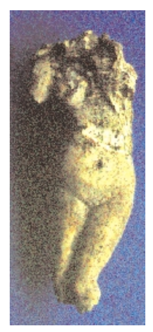
Ivory statuette from a fourth-century tomb

• Training, primarily of Ethiopian personnel, was to be provided at several levels. To this end, local trainees were employed to a total of 25 person-seasons in support roles, and 29 personseasons in professional capacities. In addition, it was possible to arrange for two Ethiopian archaeologists involved with the work to study and obtain postgraduate degrees at the University of Cambridge.